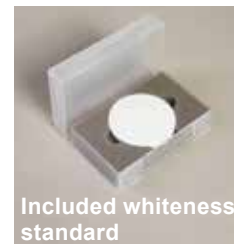
Included whiteness standard

Sensitivity can be checked at any time by measuring the included whiteness standard, which has been adjusted for each machine. In the conventional C-100, sensitivity adjustment was carried out for each measurement. This is unnecessary in the C-130, which automatically notifies the user if an adjustment becomes necessary. Simply set the standard into the machine and click the key to begin sensitivity adjustment.