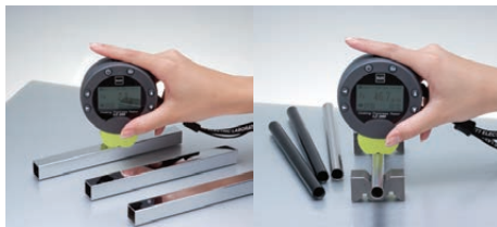
Measurement example of the square pipe and the pipe