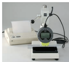
The optional Measuring stand LW-990 and Printer VZ-330