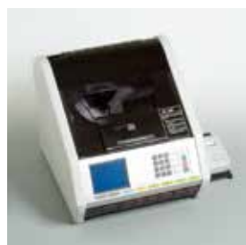
Single-grain Rice Inspector RN-600