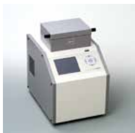
Near Infrared component analyzer AN-820