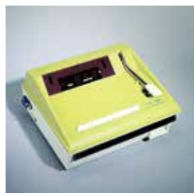
Grain Moisture Tester PB-1D2