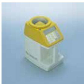
Grain Moisture Tester PM-830-2