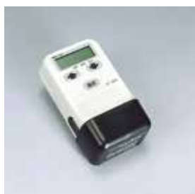
Harvest Monitor OT-300