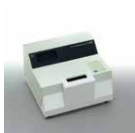
Rice Whiteness Tester C-600