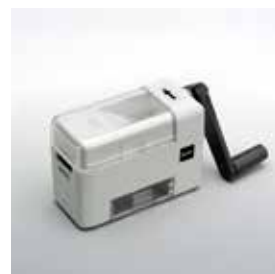
Grain husker TR-130