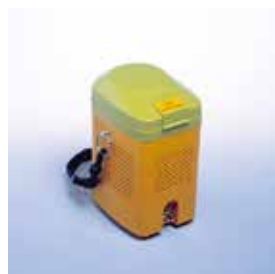
Grain Polisher Pearlst