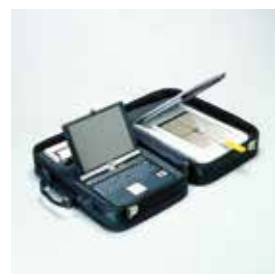
Grain Inspector RN-300