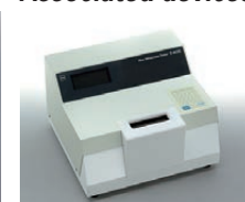
Rice Whiteness Tester C-600